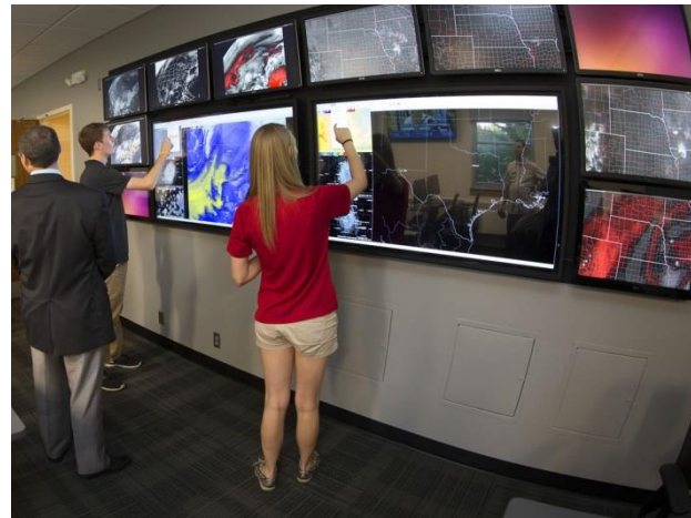
Figure 1. Interactive weather wall located in the newly-renovated Meteorology-Climatology Computer Lab (Figure 2).

The University of Nebraska-Lincoln (UNL) Department of Earth and Atmospheric Sciences (EAS) has been involved with Unidata since its inception and has been an active participant in the Internet Data Distribution, serving as a relay node. Data ingest, processing, and relay are currently handled by a 9 year old system (purchased with a 2006 Unidata Community Equipment award) that is also tasked as a web/file server for EAS and a repository for research data sets, many of which are generated from NSF-supported projects. The LDM data and Unidata-supported analysis and visualization tools are used extensively within the EAS Meteorology-Climatology undergraduate program. Value-added products generated from the LDM data are exhibited on the EAS web page ( http://weather.unl.edu/cws/ ) and on the new interactive weather wall (Figure 1). The system serves the research needs of the 30 faculty and 67 grad students in the Department of Earth and Atmospheric Sciences, the teaching needs of atmospheric science faculty and grad students, and the education of the ~60 undergraduate majors in Meteorology-Climatology and the ~300 undergraduates enrolled in EAS introductory meteorology courses. It also serves downstream Unidata community members. To not only maintain but enhance the contributions made by the UNL system to research, education, and Unidata community capabilities , we are requesting support for its replacement.