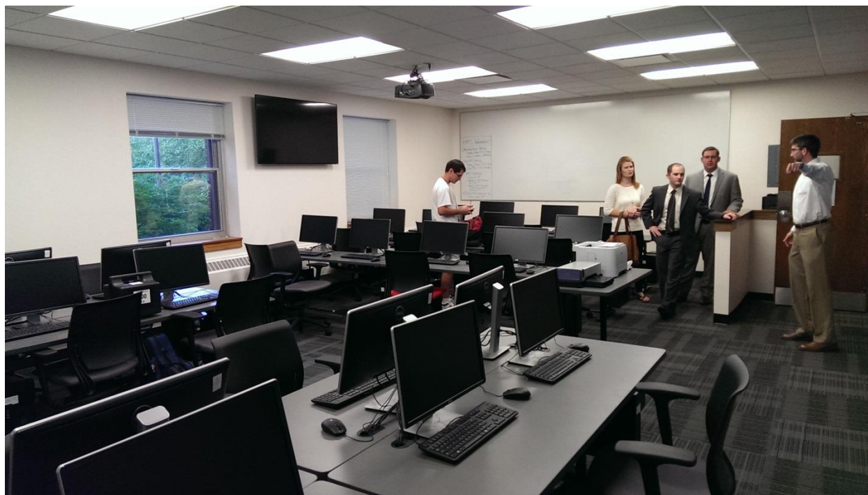
Figure 2. Newly-renovated Meteorology-Climatology Computer Lab.

capable of hosting an EDEX server for running AWIPS-II. Therefore, we are also requesting support for a standalone EDEX server that can be accessed by local CAVE clients on the workstations of the new Meteorology-Climatology Computer Lab.